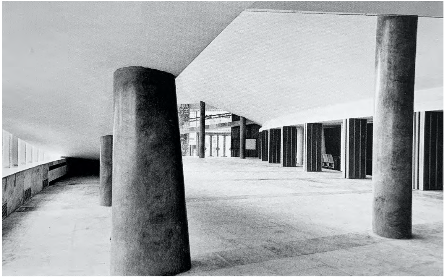
Fig.05 – Foyer (Acito 2011)