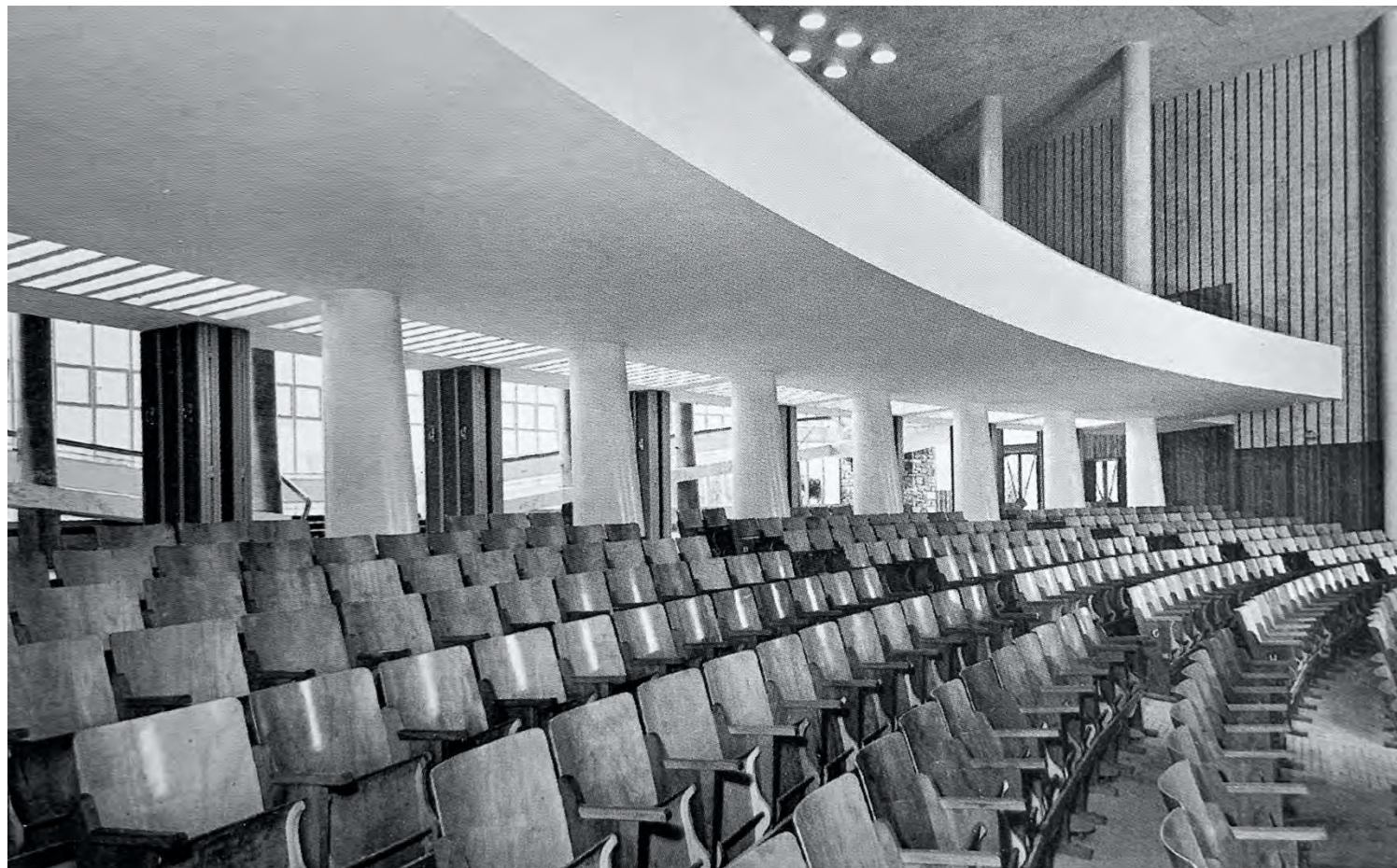
Fig.07 – Theater gallery (Acito 2011)