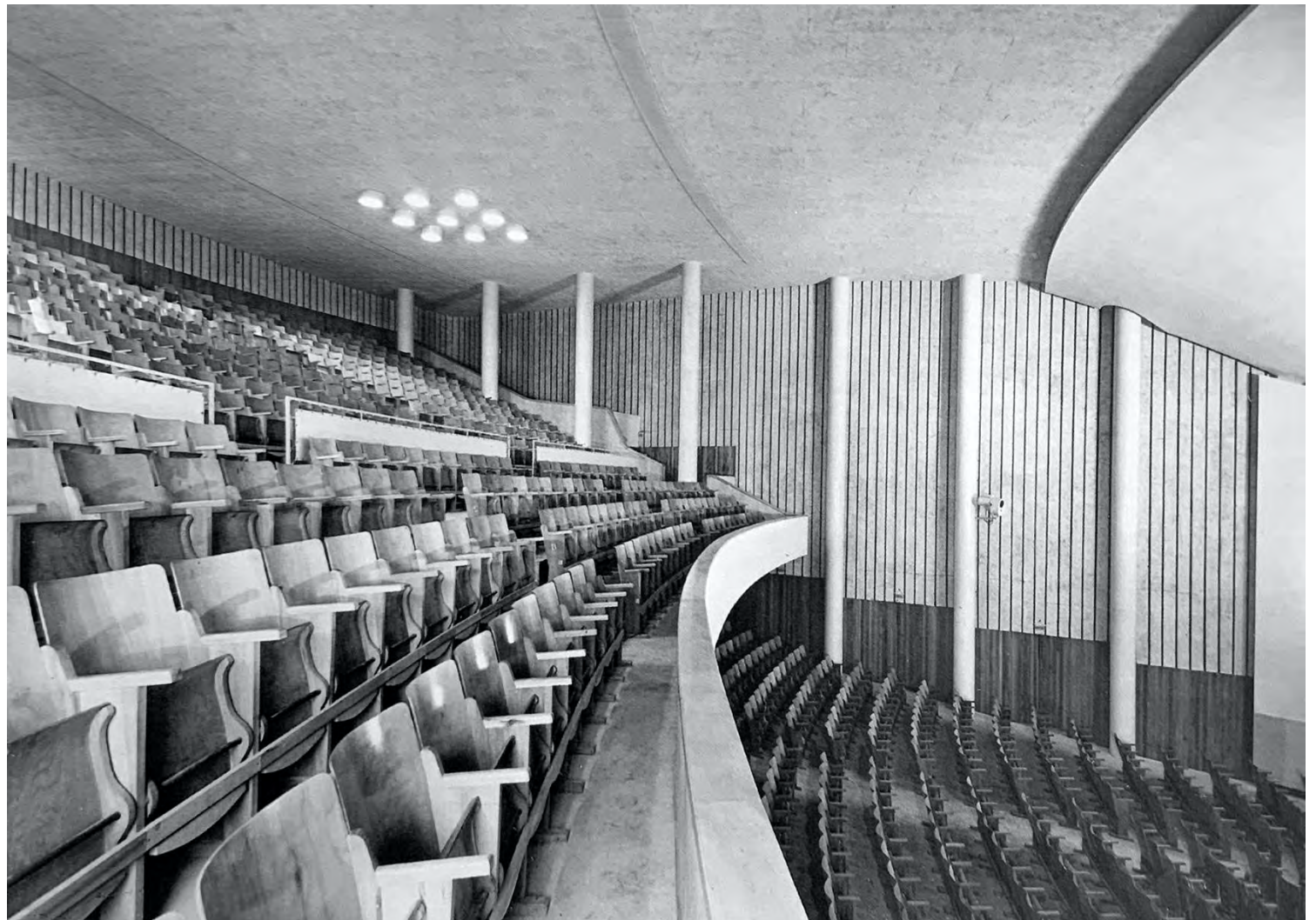
Fig.06 – Theater gallery (Acito 2011)