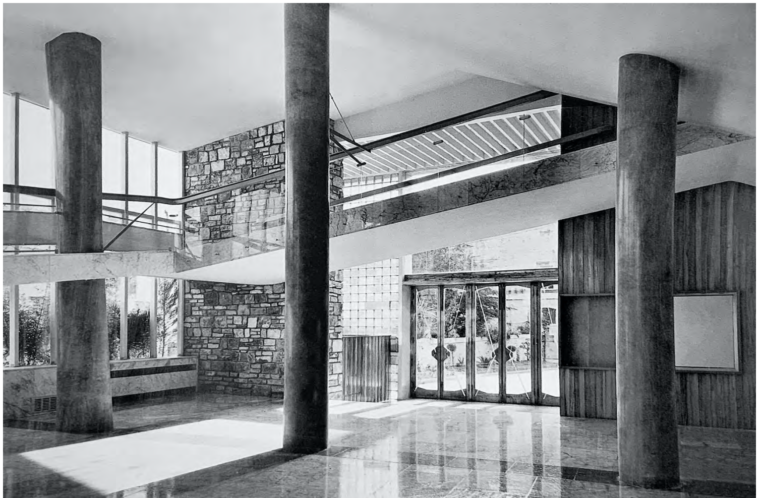
Fig.02 – Entrance to the cinema-theater Duni; Via Roma (Acito 2011)