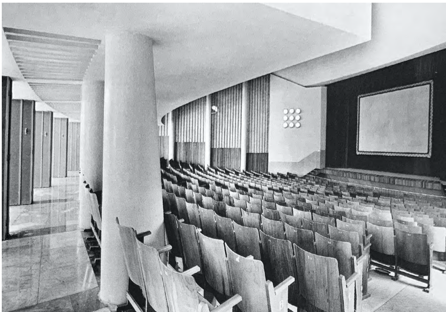
Fig.08 – Theater gallery (Acito 2011)