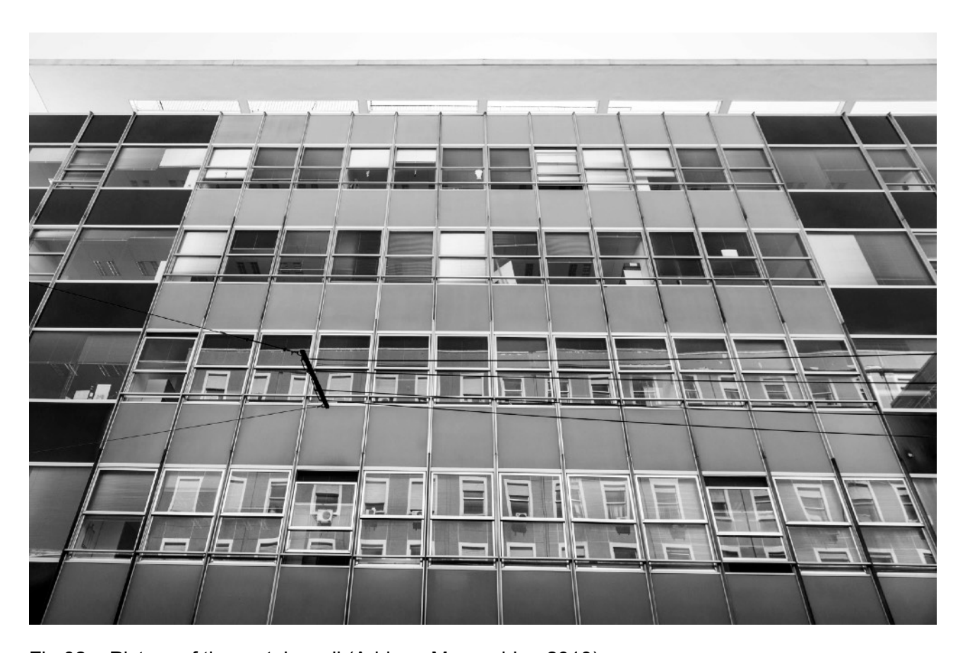
Fig.02 – Picture of the curtain wall