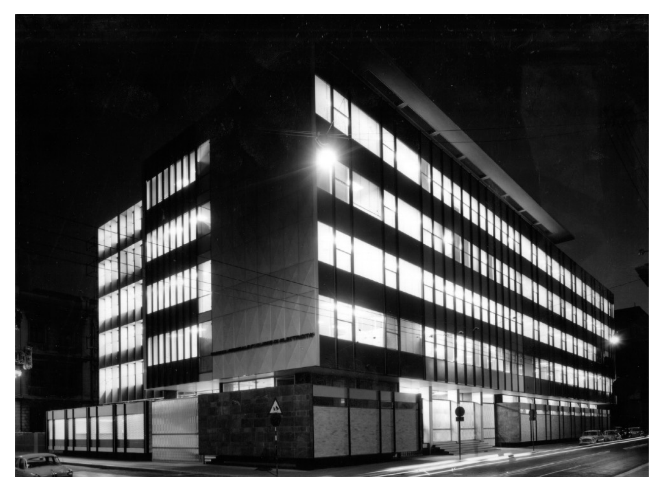
Fig.01 – Historical picture