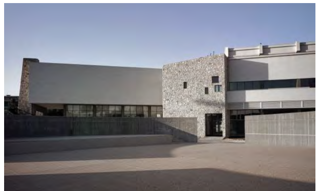
Fig.09 – Rear elevation view with arena (Alberto Muciaccia 2016)