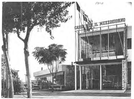
Fig.03 – Photo of the entrance (ca. 1951)