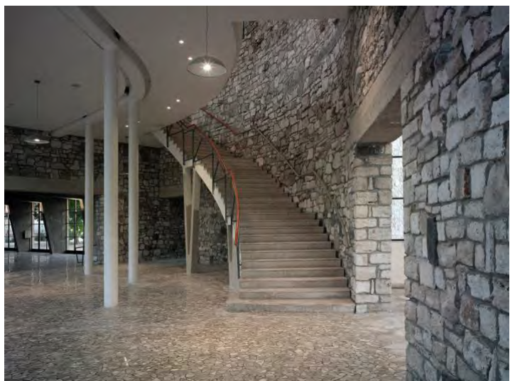
Fig.05 – Photo of the entrance hall (Alberto Muciaccia 2016)