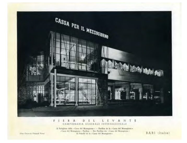
Fig.02 – Night view (1951)