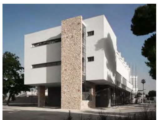
Fig.10 – East elevation view of completion (Alberto Muciaccia 2016)