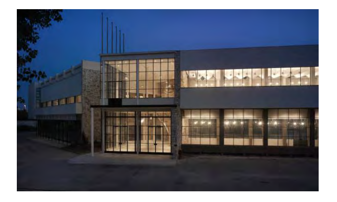
Fig.07 – Night front view (Alberto Muciaccia 2016)