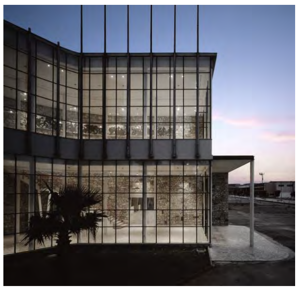
Fig.08 – Night view Hall (Alberto Muciaccia 2016)