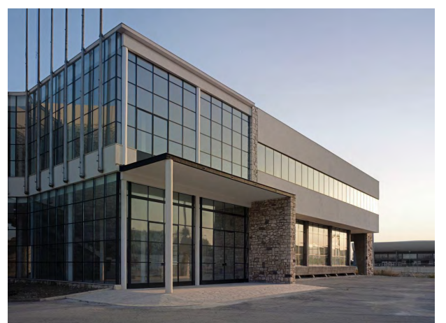
Fig.01 – View of the main facade (Alberto Muciaccia 2016)