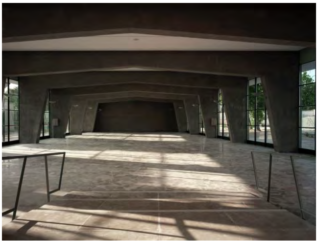
Fig.06 – Trident room photo