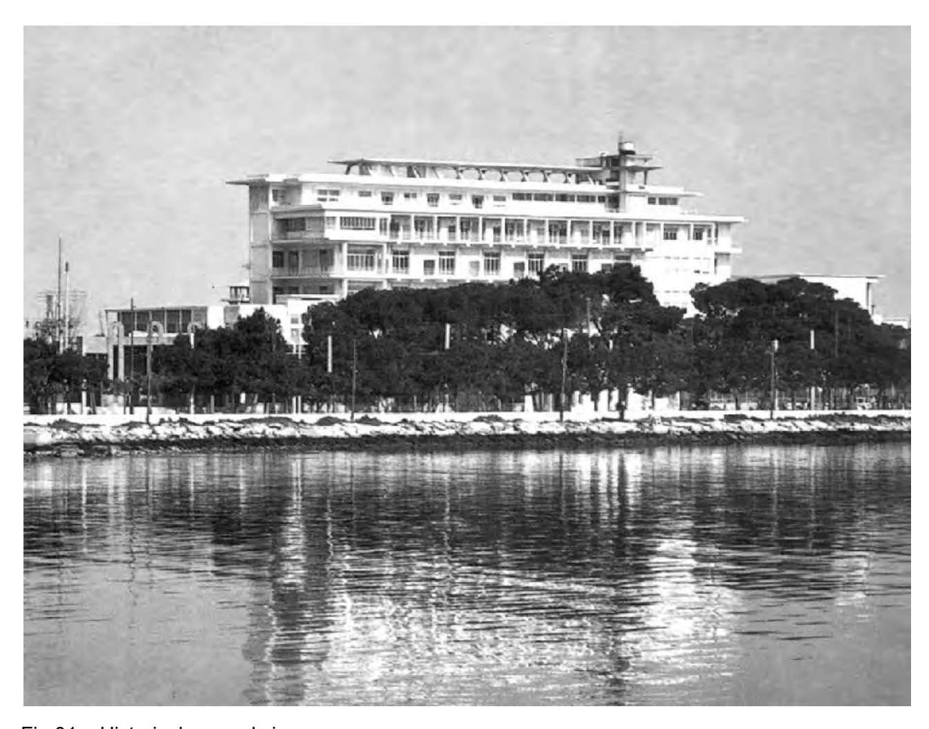
Fig.01 – Historical general view