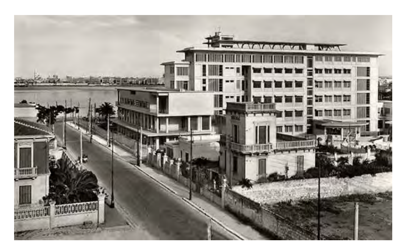
Fig.02 – Historical general view